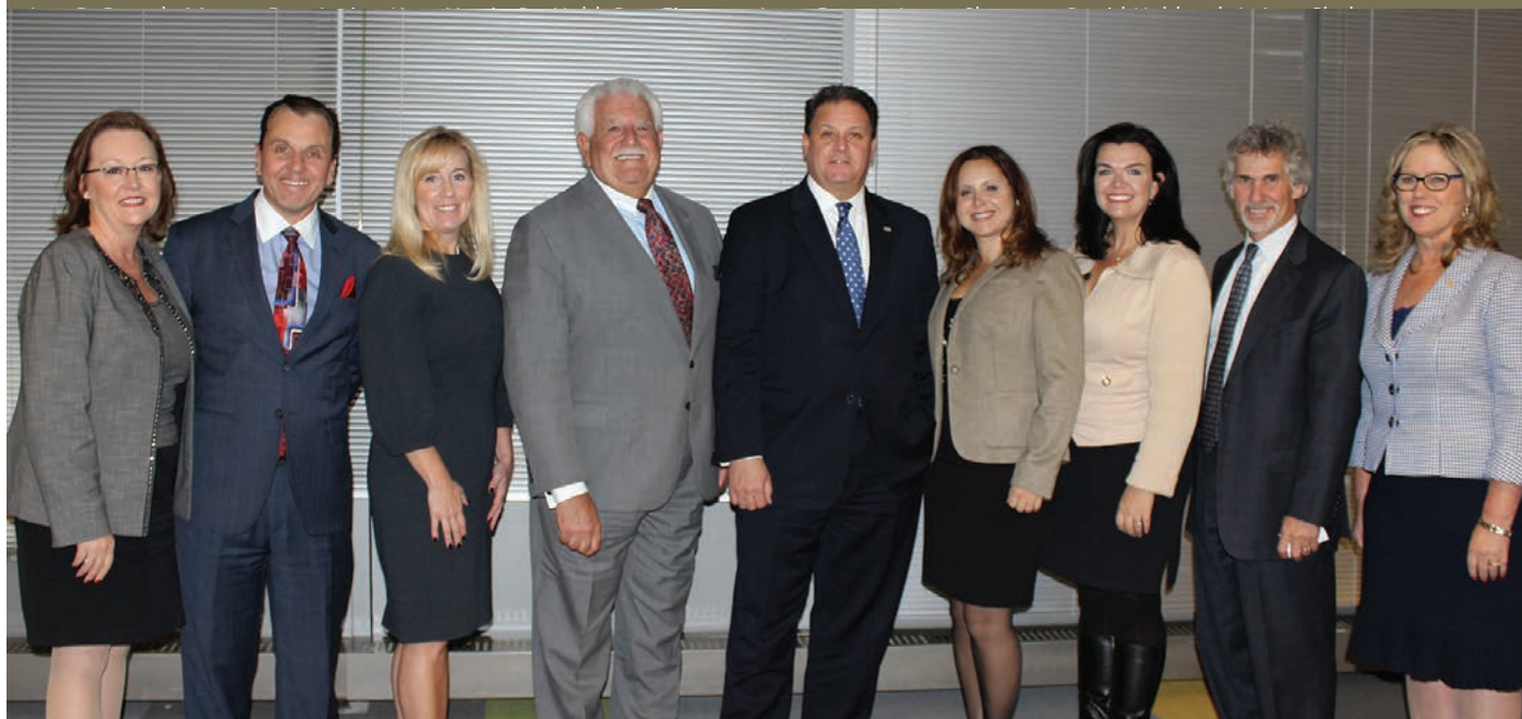
Pictured: Faculty and Educational Consultant team at the first CPRM Program Pilot, October 31, 2014, in Chicago, Illinois.

2) Understanding Coverage Differences: The Affluent and High Net Worth Client offers an evaluation of the important differences in the primary personal lines policies available for insuring the unique and complex exposures of the affluent and high net worth personal lines client. Recognizing these important differences and understanding how to design a risk management and insurance program to protect the assets of